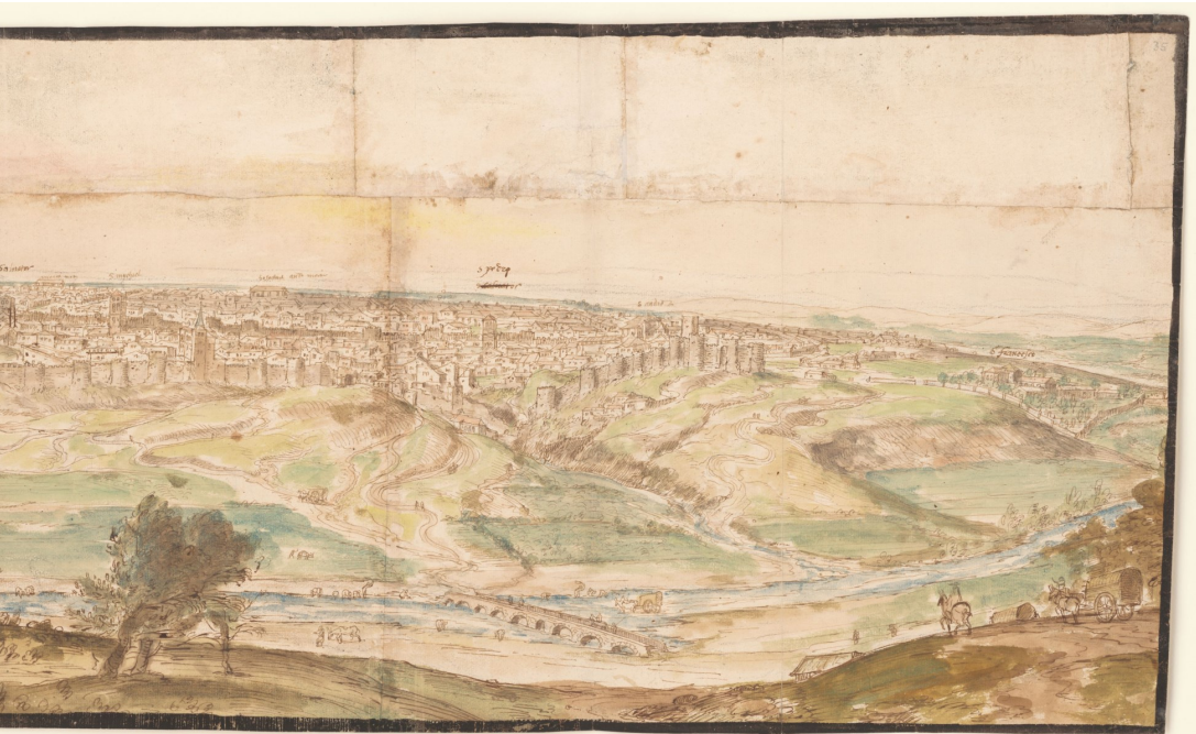
Wyngaerde, Panoramic view of Madrid, ÖNB, Cod. Min, 41 (1563)

In the Madrid 2022 International Spring School in Jewish Studies, scholars and students from various places of Jewish belonging will explore the diverse historical questions of exile, belonging and home. We aim at learning about new realms of the Jewish existence and their mutual relationship.